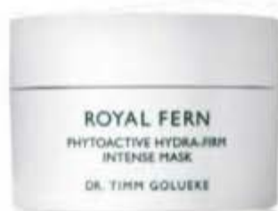
ROYAL FERN Phytoactive Hydra-Firm Intense Mask, $180. DR. BARBARA STURM MOLECULAR COSMETICS Anti-Pollution Drops, $145.