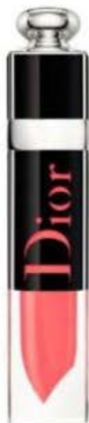
DIOR Dior Addict Lacquer Plump, $32