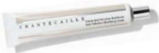
CHANTECAILLE Anti-Pollution Mattifying Cream, $98.

Make a bold, saturated pout your best accessory this season with Dior's new Dior Addict Lacquer Plump. Available in 19 glossy, highly pigmented shades, this ultra lightweight formula has a luxurious oil-like texture that softens and hydrates lips for an instantly plump finish, while the sculpted, easy-to-use tip negates the need for any additional liners or brushes.