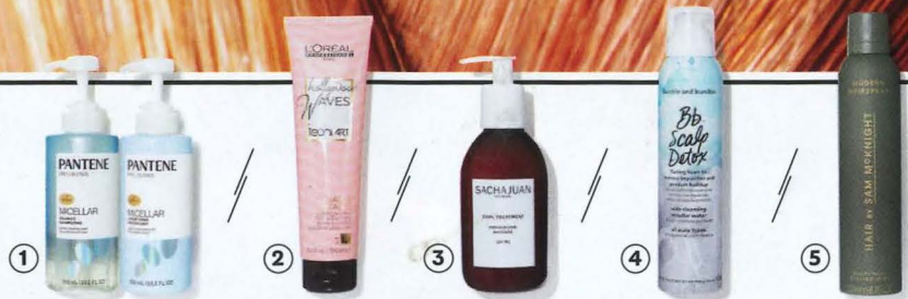
1. Pantene Pro-V Micellar Gentle Cleansing Water Shampoo and Moisturizing Milk Conditioner. ($10 each; target.com) 2. L'Oréal Professionnel Hollywood Waves Fatales Sculpting Gel Cream. ($26; us.lorealprouffessionnel.com) 3. Sachajuan Curl Treatment. ($36; barneys.com) 4. Bumble and Bumble Bb.Scalp Detox. ($34; bumbleandbumble.com) 5. Hair by Sam McKnight Modern Hairspray. ($32; net-a-porter.com)