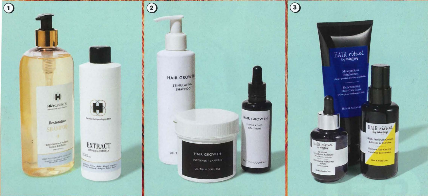
1. Harklinikken Restorative Shampoo and Hair Extract. ($68 and $88; harklinikken.com) 2. Royal Fern Hair Growth treatment collection. ($50–$295; bergdorfgoodman.com) 3. Hair Rituel by Sisley-Paris. ($75–$195; hair-rituel.com)

H air loss is no longer just an issue for men. Fewer than 45 percent of women go through life with a full head of hair—due to stress, environmental aggressors, or hereditary factors. To assist in beneficial growth, three new hair-care systems are here to save the day.