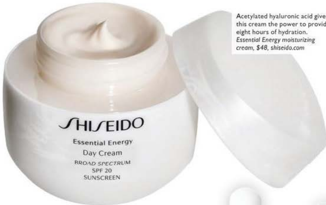
Acetylated hyaluronic acid gives this cream the power to provide eight hours of hydration. Essential Energy moisturizing cream , $48, shiseido.com