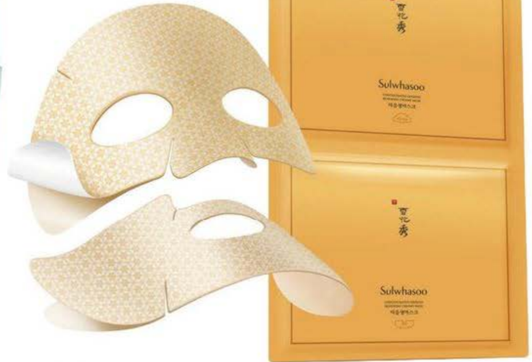
Energized with ginseng, the groundbreaking creamy sheet mask brightens and tightens dull skin. Concentrated Ginseng Renewing Creamy mask , $120, us.sulwhasoo.com