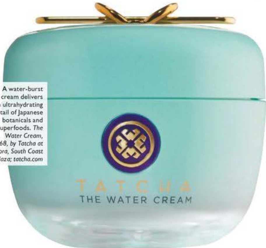
A water-burst cream delivers an ultrahydrating cocktail of Japanese botanicals and superfoods. The Water Cream , $68, by Tatcha at Sephora, South Coast Plaza; tatcha.com