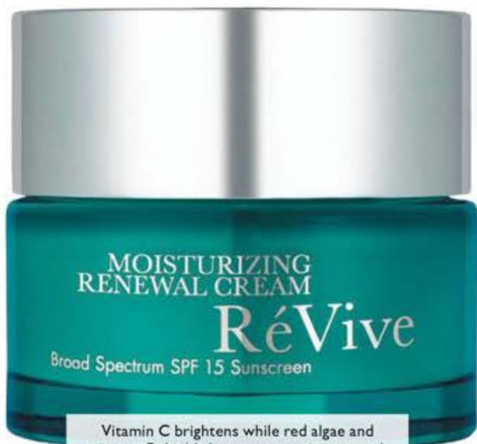
Vitamin C brightens while red algae and vitamin E shield skin against environmental aggressors and free-radical damage in an SPF 15 day cream. Moisturizing Renewal cream broad spectrum SPF 15 sunscreen , $210, by RéVive at bluemercury.com ; reviveskincare.com