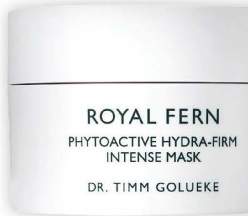
Chlorophyll acts as an anti-inflammatory and prevents collagen loss while other botanicals brighten and nourish skin against environmental pollutants in this hydrating mask. Phytoactive Hydra-Firm Intense mask , $180, by Royal Fern at Bloomingdale's, Fashion Island