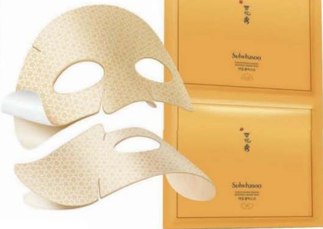
Energized with ginseng, the groundbreaking creamy sheet mask brightens and tightens dull skin. Concentrated Ginseng Renewing Creamy mask , $120, us.sulwhasoo.com