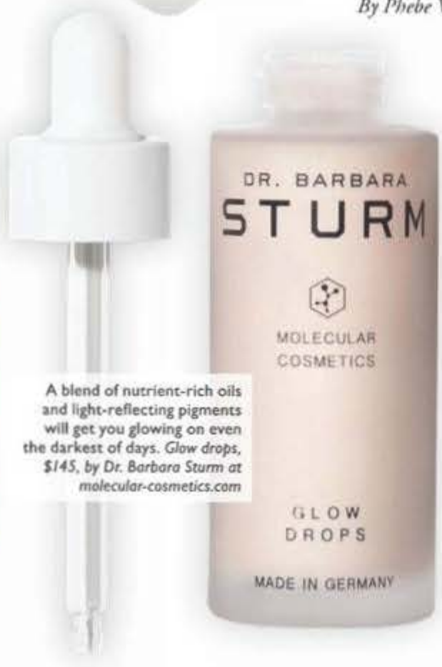
A blend of nutrient-rich oils and light-reflecting pigments will get you glowing on even the darkest of days. Glow drops , $145, by Dr. Barbara Sturm at molecular-cosmetics.com