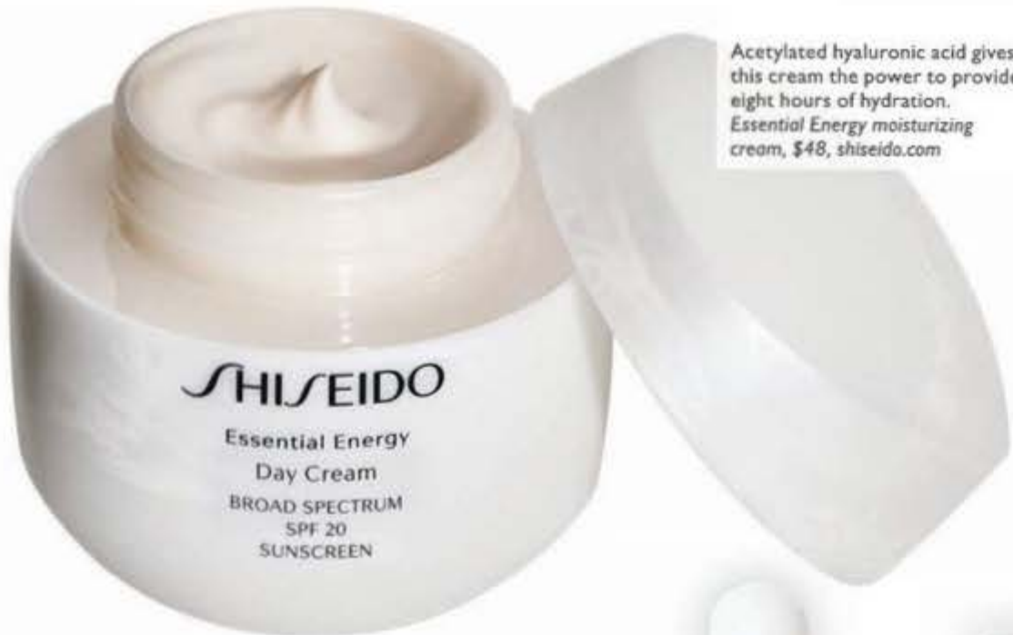
Acetylated hyaluronic acid gives this cream the power to provide eight hours of hydration. Essential Energy moisturizing cream , $48, shiseido.com