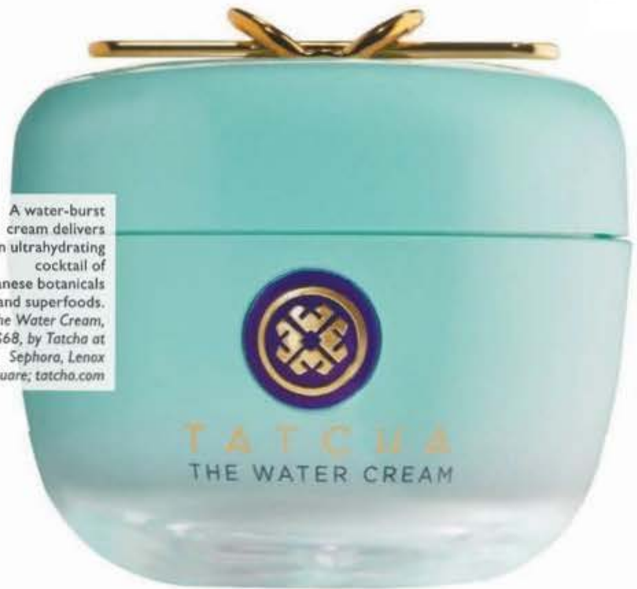
A water-burst cream delivers an ultrahydrating cocktail of Japanese botanicals and superfoods. The Water Cream , $68, by Tatcha at Sephora, Lenox Square; tatcha.com