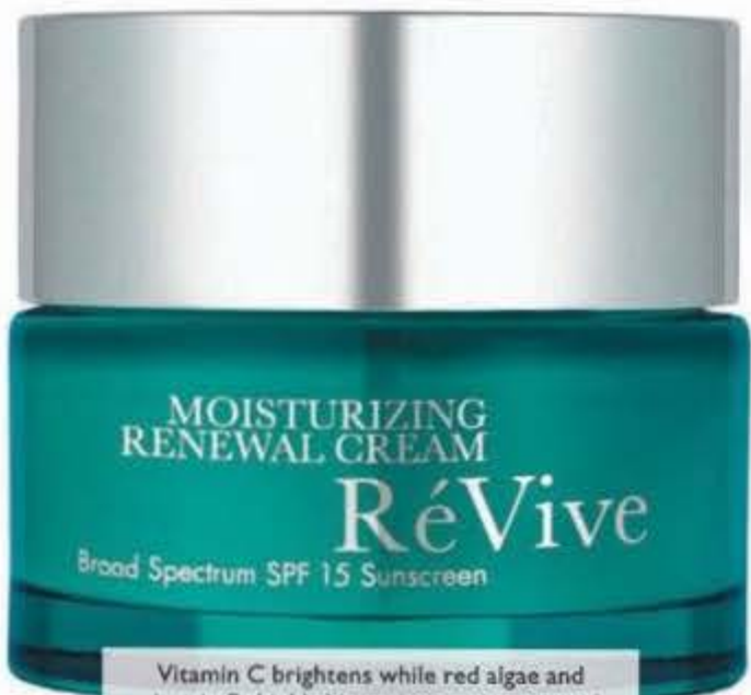
Vitamin C brightens while red algae and vitamin E shield skin against environmental aggressors and free-radical damage in an SPF 15 day cream. Moisturizing Renewal cream broad spectrum SPF 15 sunscreen , $210, by RéVive at bluemercury.com ; reviveskincare.com